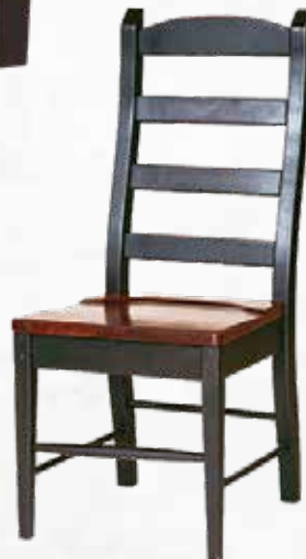
Country Ladder Back Side CT98 18" W x 17" D x 40" H