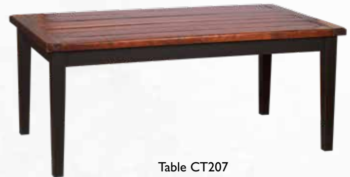
Table CT207 42" W x 72" D x 31" H Shown in black w/ cherry top