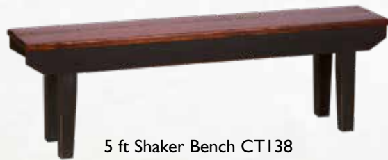
5 ft Shaker Bench CT138 60" W x 12" D x 18" H Shown in black w/ cherry top Solid maple, 5/4 rough sawn top

8/4 thick rough sawn top w/bread board ends