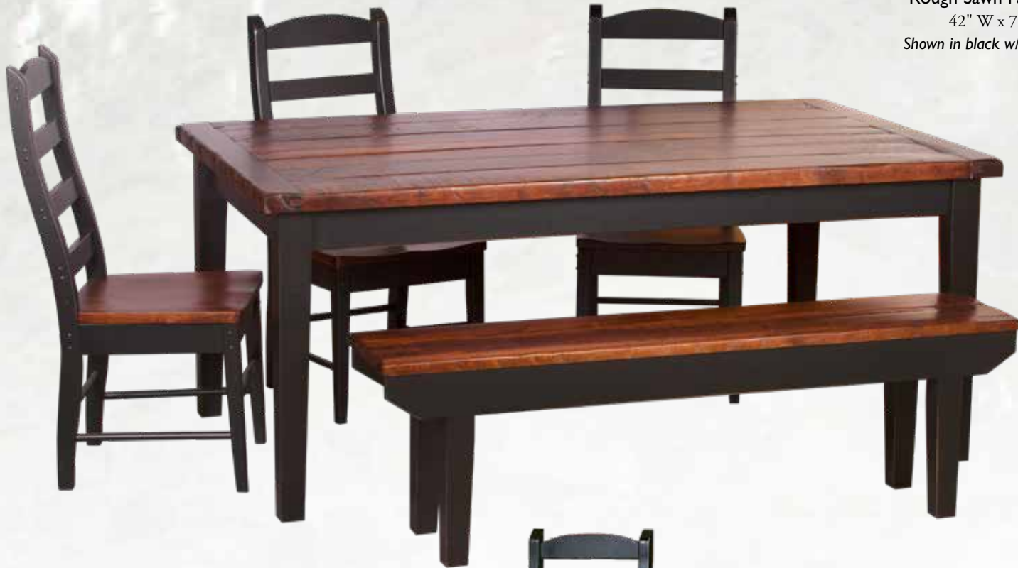
Rough Sawn Farm Table CT207 42" W x 72" D x 31" H Shown in black w/ Michael's cherry top

8/4 thick rough sawn top w/bread board ends